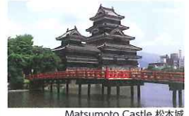
Matsumoto Castle 松本城