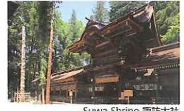
Suwa Shrine 諏訪大社