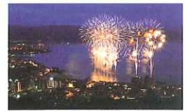
Lake Suwa (Fireworks) 諏訪湖