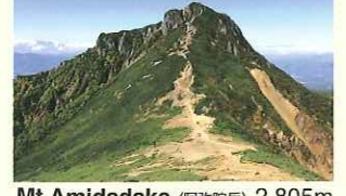
Mt. Amidadake (阿弥陀岳) 2,805m