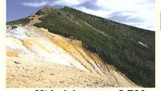
Mt. Iodake (硫黄岳) 2,760m