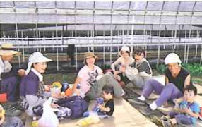
Having a break in the farm work 農作業の合間の団楽風景