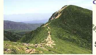
Mt. Tengudake (天狗岳) 2,646m