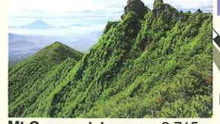
Mt. Gongendake (権現岳) 2,715m