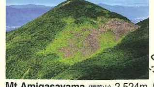
Mt. Amigasayama (編笠山) 2,524m