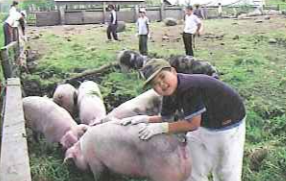
Dairy farm experience 酪農体験の様子

This viewpoint is located about 20 minutes' walk from the Yatsugatake Museum of Art. The surprising proximity of Mt. Yatsugatake, visible nearby, puts you in the mood for climbing. ハケ岳美術館から20分くらい歩いて行くビューポイントです。驚くほどハケ岳の山が近くに見えるので、このまま登りたい気分になる場所です。