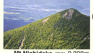
Mt. Nishidake (西岳) 2,398m