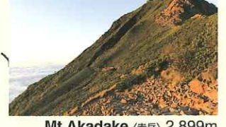
Mt. Akadake (赤岳) 2,899m