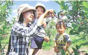
Picking is great fun for children 摘み取りは子供さんが大喜び