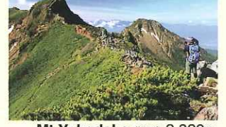
Mt. Yokodake (横岳) 2,829m