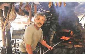
Homemade pizza baked in our stone oven. Delicious! 石窯で焼く手作りピザは最高!