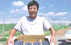
Enjoy some tasty blueberries! 美味しいブルーベリーをどうぞ!