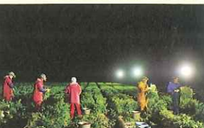
The celery harvest begins at 1 a.m. セロリの収穫は夜中の1時に始まる