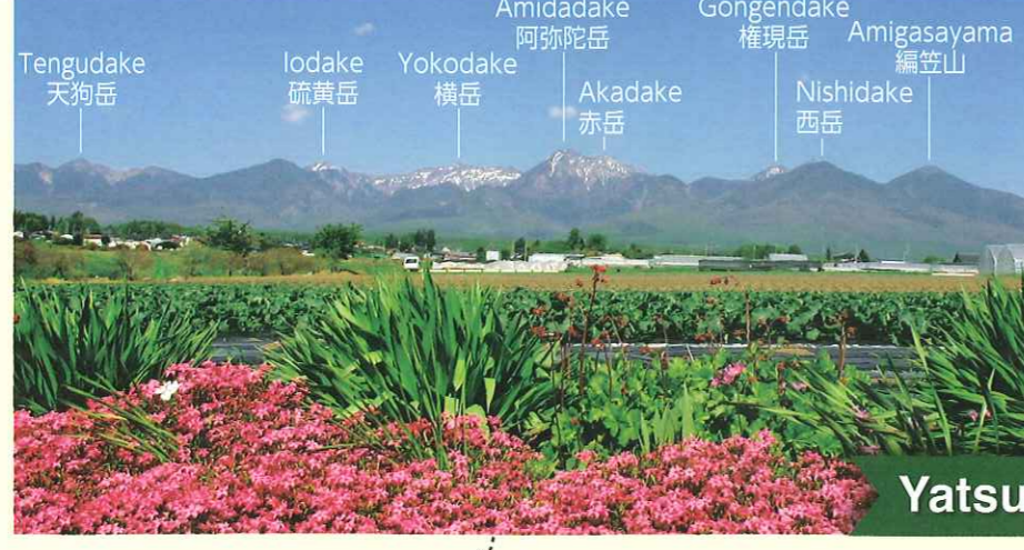
Yatsugatake Mountain Range (ハケ岳連峰)

Mt. Yatsugatake can be seen close up to the east and the mountains of the Northern Alps are visible in the distance to the north west. At night, the city surrounding Lake Suwa sparkles like a jewelry box. 東まわりにハケ岳、遠く北西には北アルプスの山並みを眺望することができます。夜は諏訪湖周辺の夜景が宝石箱のように見えます。